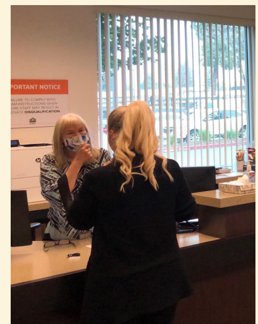
DRE Exam Centers

Sending an earnest money deposit alone to an escrow or title company does not open escrow; it simply opens an escrow file. For escrow to be considered formally opened, the earnest money deposit must be accompanied by escrow instructions jointly signed and approved by both the buyer and the seller, which would fulfill the two essential elements listed above.