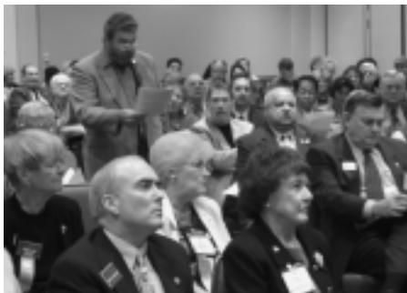
Attendees were provided the opportunity to engage in an open forum with the DRE.

The meeting concluded with questions from the audience and ensuing discussion. 🏠